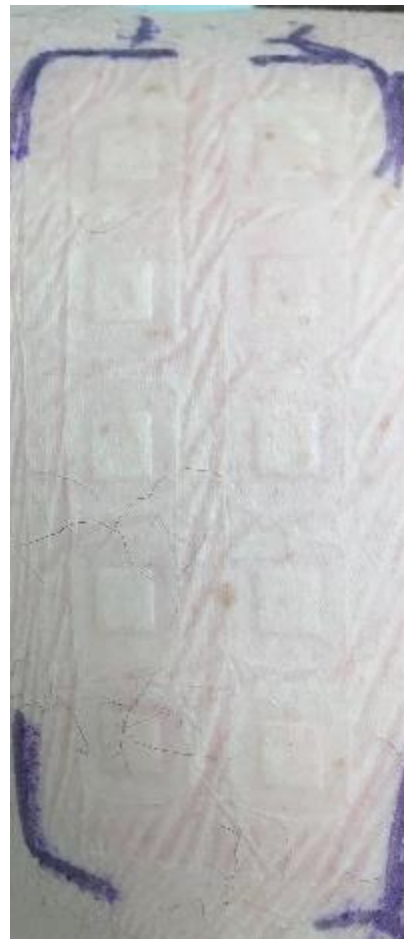
Example 2: Close up