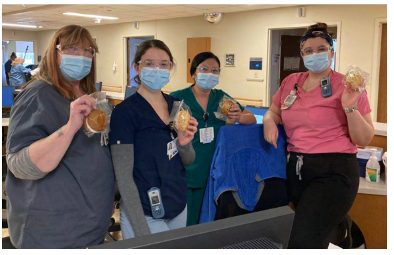
The Whoopee Wagon delivered 300 Whoopee pies for employees at the Saints Campus on March 10, 2021