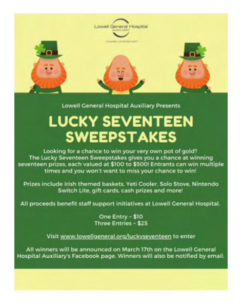
Our newest initiative, The Lucky Seventeen Sweepstakes, raised over $10,000 in its first year.