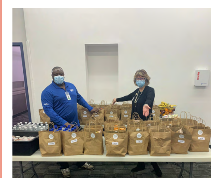
Bianco Catering delivered bag lunches for volunteers and staff at the Mass Vaccine Program on March 1, 2021