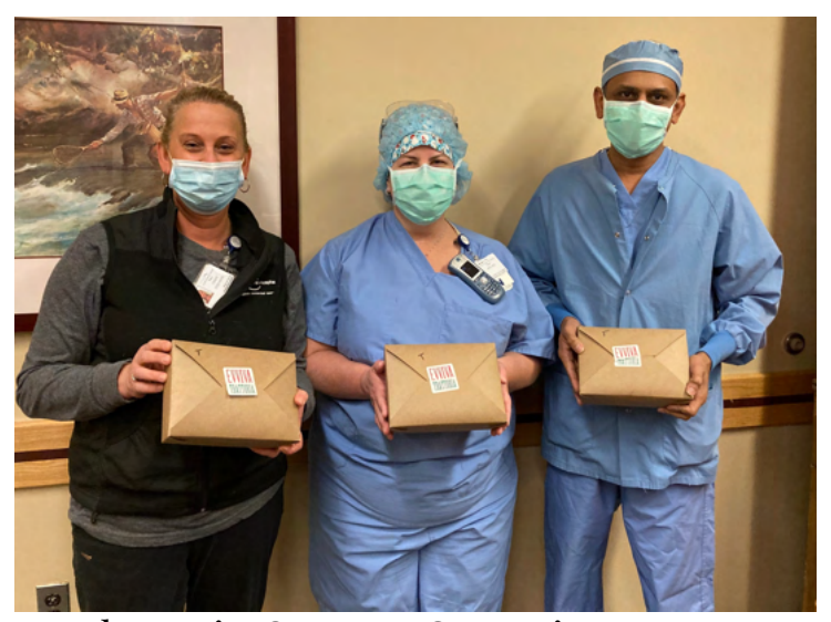
Evviva Trattoria delivered 157 box lunches to the Main Campus Operating Room and Drum Hill Surgical Center on December 29, 2020.