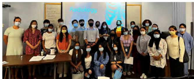
Tufts Medical Center High School Summer Interns meet for a weekly learning workshop, fostering valuable connections and knowledge-sharing opportunities.