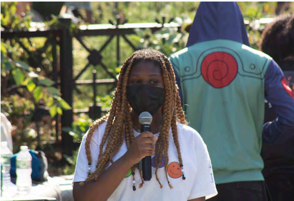
Center for Teen Empowerment youth speaks at local community event.

Tufts Medical Center is committed to reducing health disparities and inequities, while improving the health and well-being of the communities we serve. Through our community health needs assessment process, we seek to identify current and emerging health needs. To increase our impact, we collaborate with community partners, provide culturally and linguistically appropriate health services and resources, and address community health needs through education, prevention, and treatment.