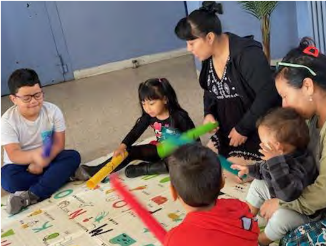
Children play with their peers and foster social connections.