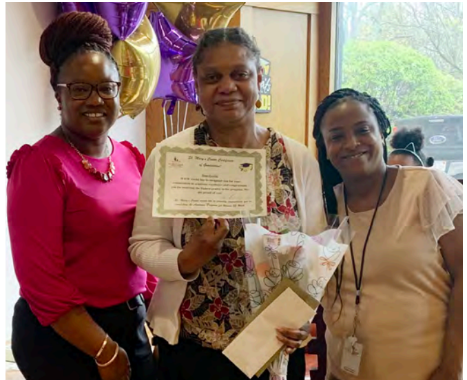
St. Mary’s Center for Women and Children staff and graduates celebrate the success of the Women@Work program, which has provided critical job training and employment opportunities.