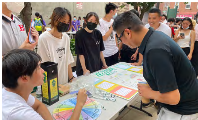
Youth actively engage in learning about the harmful effects of smoking at the Chinatown National Night Out event.

Youth Worker, Boston Asian: Youth Essential Service